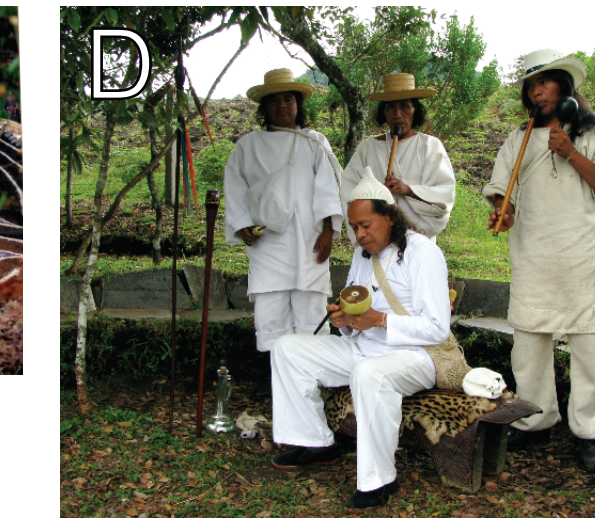
La Loma (place of divination)