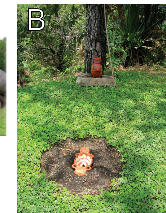
Woman's Moon place