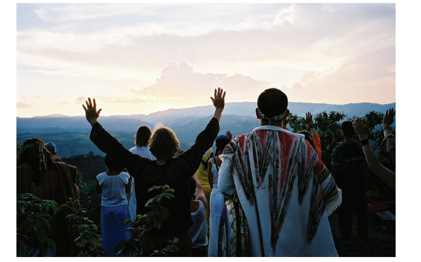
Enjoy your day!