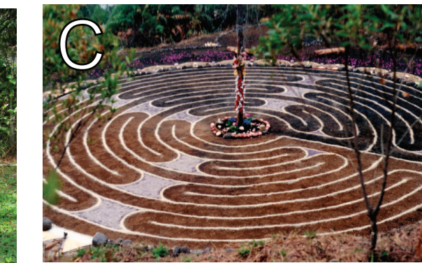
Oshoka (ceremonial place)